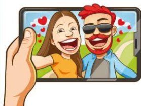
A Parent's Guide to Sharing Pictures